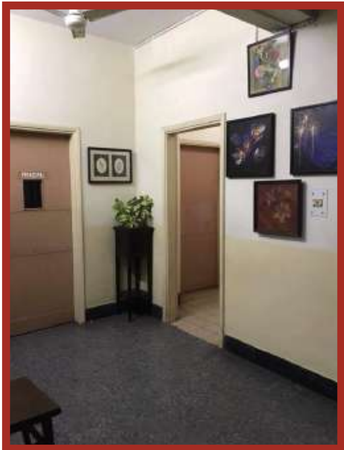
The hallowed room that was her office for years.

“O teach us Alma Mater to be both pure and true...”